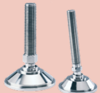
Standard Base all stainless adjuster