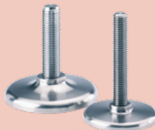
Low profile stainless steel adjuster with standard nitrile pad